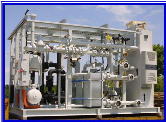
Heat Treat Chiller Controls

make us exceptionally well equipped to handle your company's individual needs.