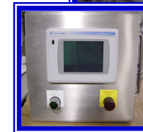
Food & Beverage and Sanitary Washdown Applications UL Certified

Contact us today to find out how the ICE Team can go to work for you.