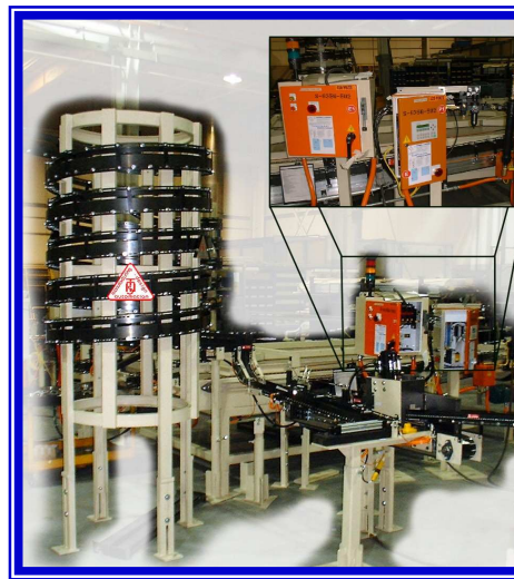
Various Material Handling Automation